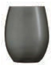
Plata C6 VASOS 36 cl Ref: 9219015 Ref: AIF J9015 4/220 M: Ø 81 mm H: 102 mm P: 140 gr 29,44€

Características Colores metalizados. Resistentes a más de 2.000 ciclos de lavado industrial sin degradación.